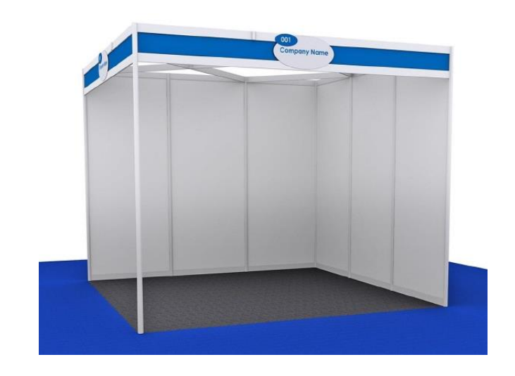
Table Top $1,750